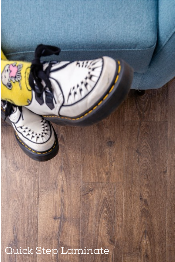
Quick Step Laminate

The Snugs feature UPVc double glazing for warmth and security. The electrics are by way of slimline switches and sockets including USB/USBc fittings at key locations for charging convenience. Flooring is Quick Step Laminate throughout (available in a range of colours) which is easy to clean and offers a waterproof guarantee. To maximise wall space, we install ceiling mounted Infra Red heaters which use radiant heat to warm the room evenly.