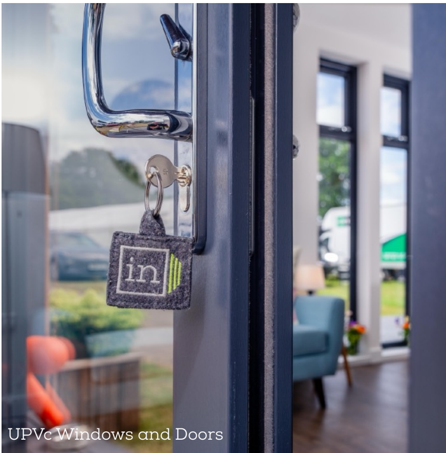
UPVc Windows and Doors