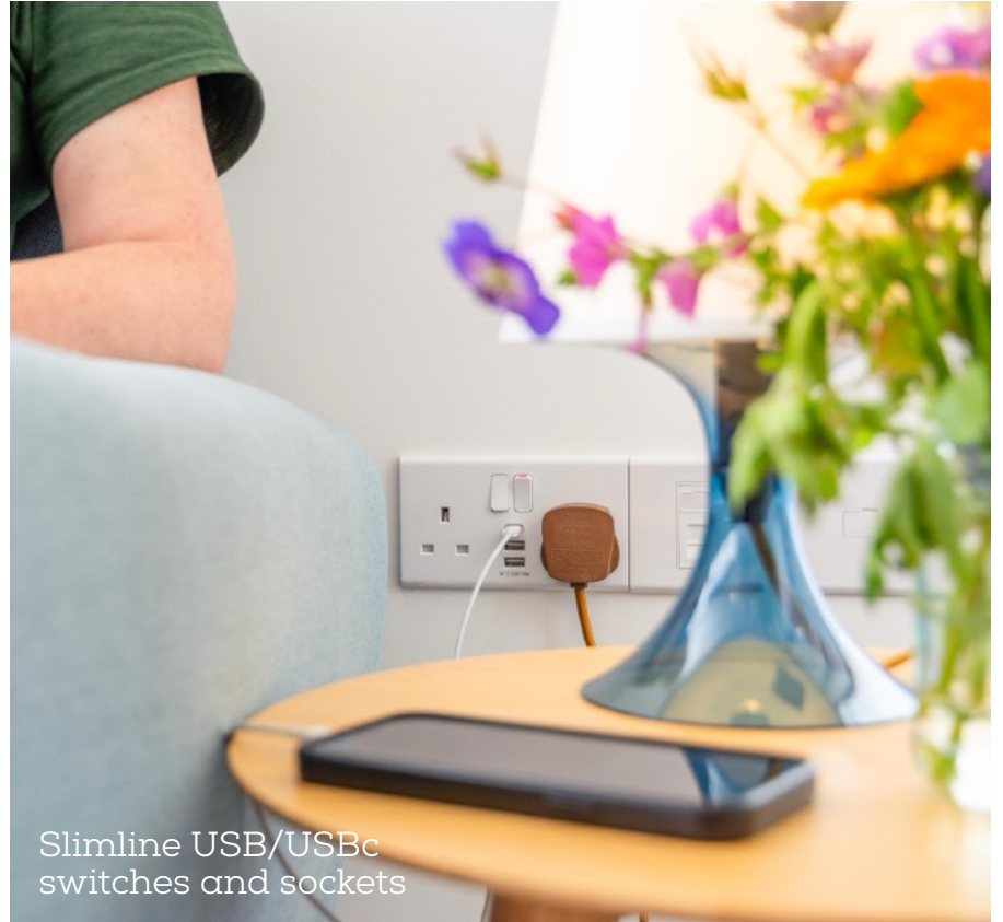
Slimline USB/USBc switches and sockets